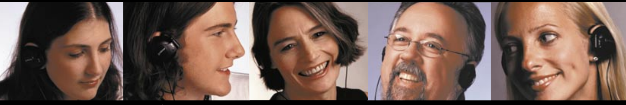
choose your program

select a language hear it again create your own path