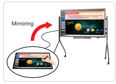
Interactive Whiteboard Connectivity