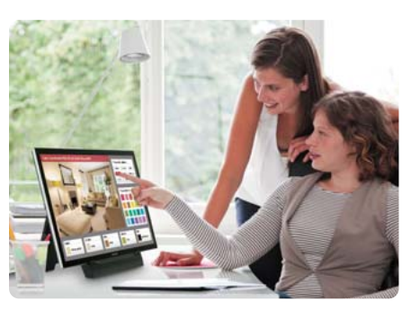
Visually Enhanced Discussions