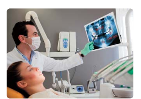
Medical Services and Consultations