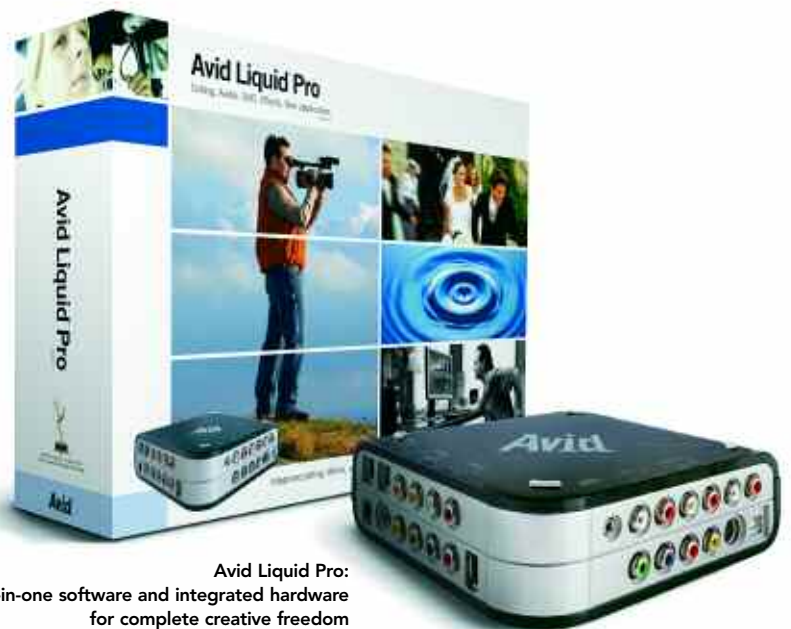
Avid Liquid Pro: all-in-one software and integrated hardware for complete creative freedom

The Avid Liquid Pro breakout box also captures to an uncompressed codec as well as to MPEG-IPB for stream-lined DVD production. Use Avid Liquid Pro to monitor SD and HDV with real-time effects on a broadcast monitor to ensure correct colors and composites.