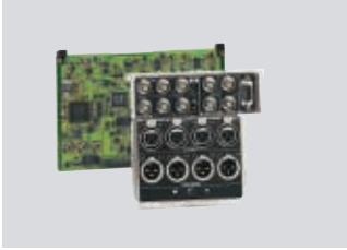
AJ-YA93P Analogue Interface Board