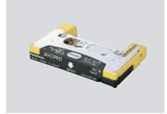
AJ-CS455P Mini-DV Cassette Adapter