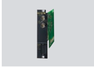
AJ-YA94G Serial Digital Interface Board