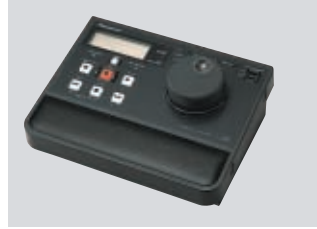
AJ-A95 Remote Control Unit (RS-422A)