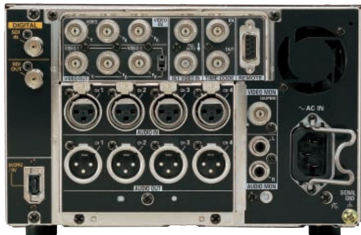
Rear Panel Connectors (equipped with AJ-YA93P and AJ-YA94G interface boards)