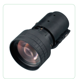
Optional Lens VPLL-ZM32